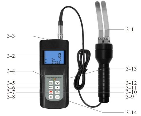
Fig.1 Overall Descriptions

Sensor Carrying case Operation manual Optional accessory USB cable and software Bluetooth adapter and software 3. OVERALL & DISPLAY DESCRIPTIONS